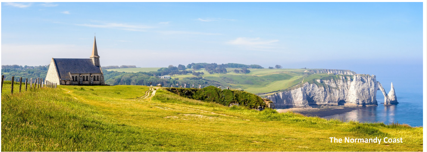
The Normandy Coast

Day 1 Depart the USA Begin your thrilling journey as you depart from the USA on an overnight flight to the enchanting city of Paris, France. Enjoy meals & beverages onboard.