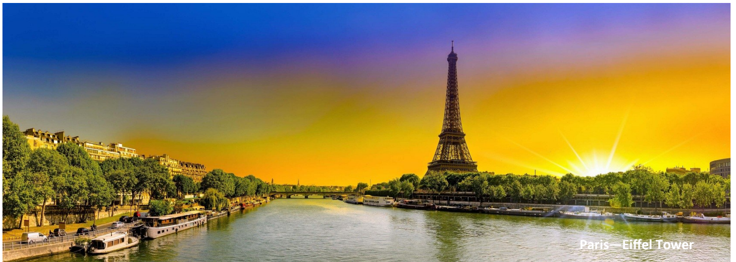
Paris – Eiffel Tower

Day 7 Reims - City Tour - Epernay & Champagne Tour - Reims Enjoy a captivating city tour of Reims, including the revered Reims Cathedral. Your exploration continues with a visit to the picturesque village of Epernay, renowned for its abundance of major Champagne houses such as Moët & Chandon, De Castellane, Mercier, & Pol Roger – all situated along the Avenue de Champagne. Here enter a famous Champagne house & traverse the cellars & caves to learn about this world-famous bubbly beverage. Then toast to life & adventure with an exquisite champagne tasting. (B)