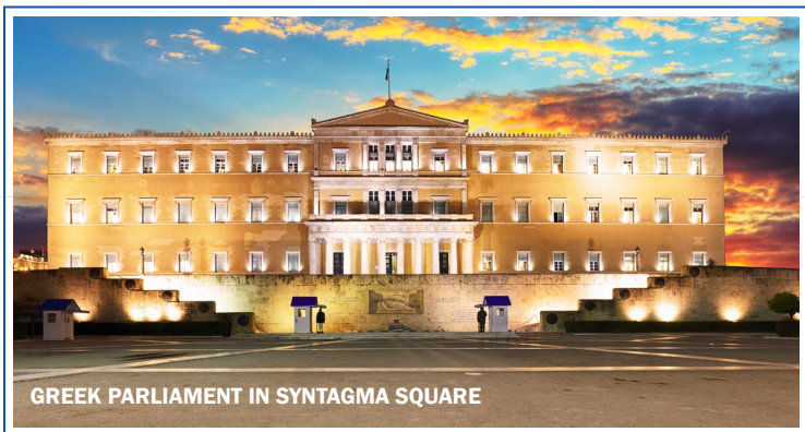
GREEK PARLIAMENT IN SYNTAGMA SQUARE

After your breakfast, enjoy free time to relax or explore the volcanic island of Santorini on your own at your leisure or join an exciting optional Santorini wine adventure tour. Be sure to visit the Prehistoric Museum in Fira that hosts artifacts from the sites of Akrotiri and Ancient Thira, including the famous wall paintings