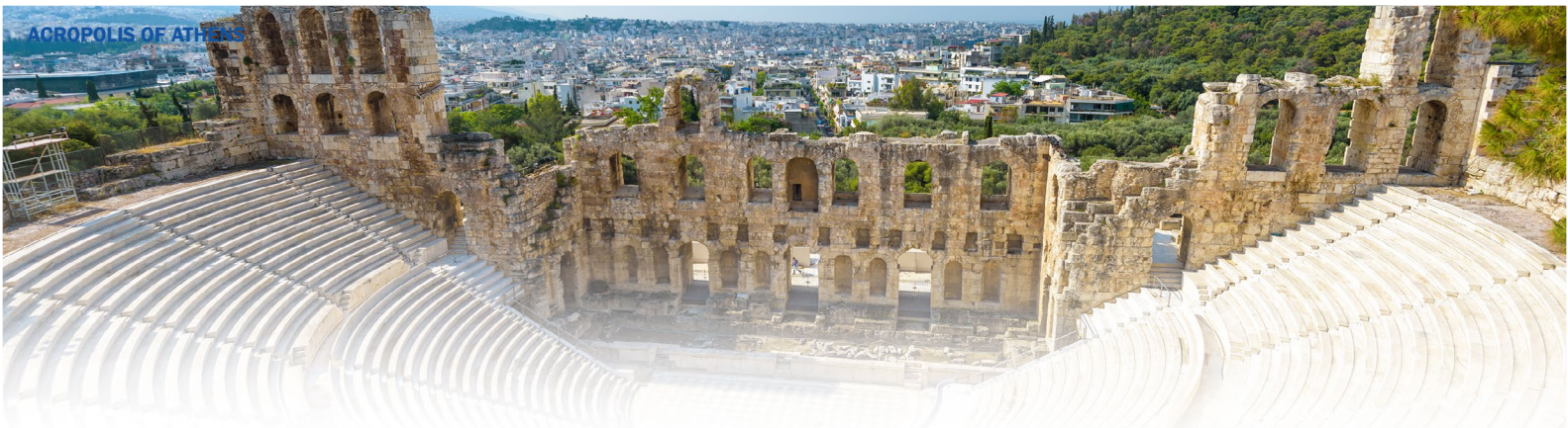
ACROPOLIS OF ATHENS

or discovering the colorful beaches of the Island also created by the volcanic eruption. Do not miss visiting the traditional village of Oia—the most photographed place in Greece—best known for its breathtaking sunsets. Small white homes sprinkle the steep hillsides, interspersed by splashes of rich ochre, deep fuchsia, cobalt blue, oyster pink and earthy red make Oia a magical place. After your free day or optional tour experience, return to the hotel for an independent evening at your leisure.